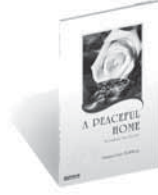
A Peaceful Home