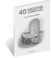
40 Hadiths For Children With Stories