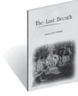
The Last Breath