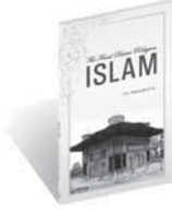
The Final Divine Religion ISLAM