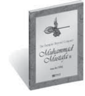
The Exemplar Beyond Compare