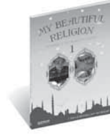
My Beautiful Religion 1