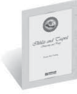
Ikhlas And Taqwa