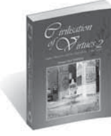
Civilisation of Virtues 2