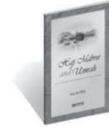
Hajj Mabruur and Umrah