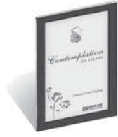
Contemplation in Islam