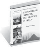
Endowment, Charity, and Service in Islam