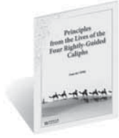
Principles from the Lives of the Four Rightly-Guided Caliphs