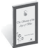
The Society of the Age of Bliss