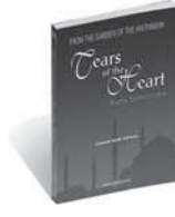
Tears of the Heart