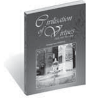
Civilisation of Virtues 1