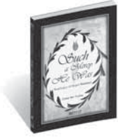
Such a Mercy He Was