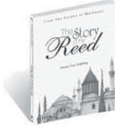
The Story of the Reed