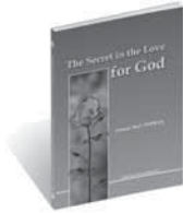
The Secret in the Love for God